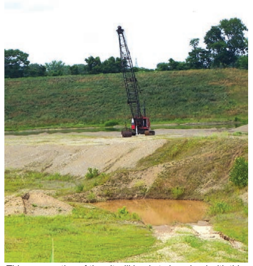
This new section of the pit will begin to be mined with this dragline, later this summer.