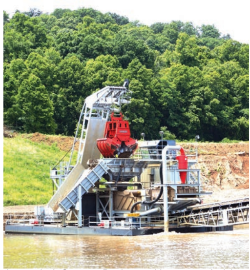
Jaymar, Inc's Supreme Dredge provides a second mining area within the confines of the quarry pit.

til the weather warms up. Even with huge stockpiles in place, it doesn't take long to deplete the inventory when filling a number of empty barges.