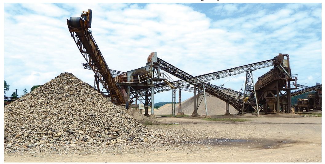
The screen plant provides six products including concrete and masonry sand as well as four classifications of aggregate.

Hall said that the facility remains in operation year round unless the outside temperature drops to around 22 degrees F. When it is that cold, his crew works on regularly scheduled maintenance items un-