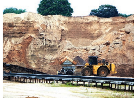
An operator loads material from an area of the quarry face where recent rains have created a washout area.