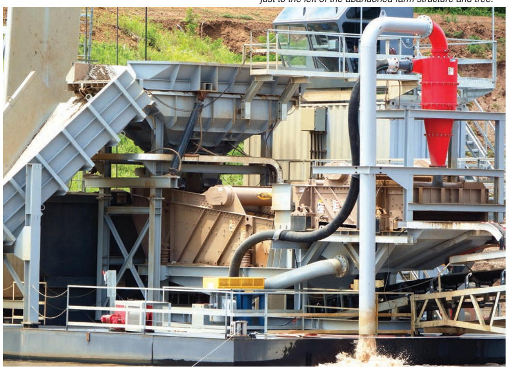
The dredge is outfitted with a 6-foot x 16-foot double deck Deister primary screen, a McLanahan Cyclone and a 7-foot x 12-foot Deister fine recovery screen.