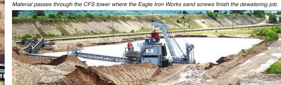
Jaymar's dredging operation from atop the pit. The top of the screen plant can be seen in the distance over the far berm, just to the left of the abandoned farm structure and tree.